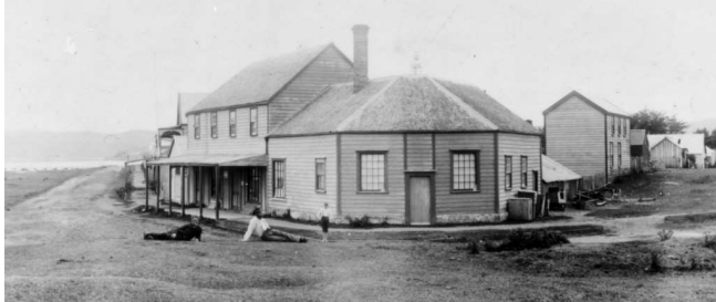
General store, corner of Cliff and wallis Sts, 1897

Blandour opened a general store here before 1870. Later Gilmour Bros. purchased it running it till 1886,