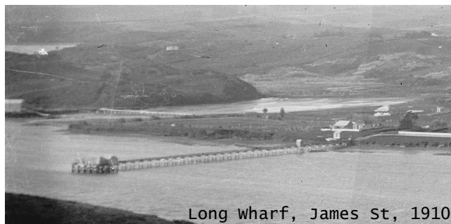
Long wharf, James St, 1910